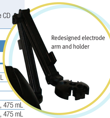
Redesigned electrode arm and holder

For more information, contact your local Thermo Scientific products dealer or call our customer and technical service experts at 1-800-225-1480 (for the US and Canada) or visit www.thermoscientific.com/water .